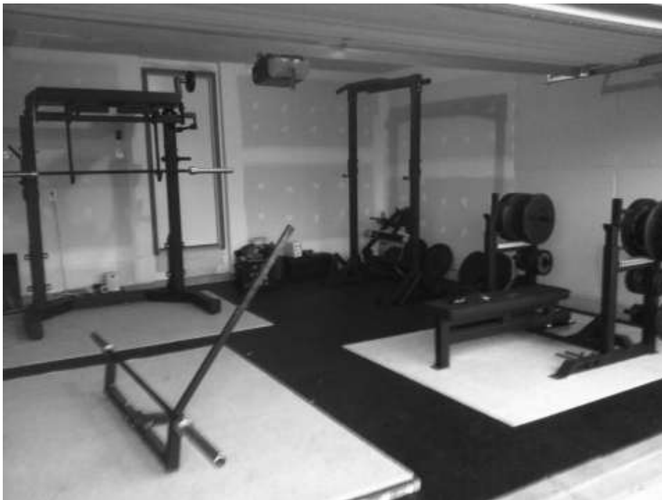
Figure 9: Five Points - Native Owned