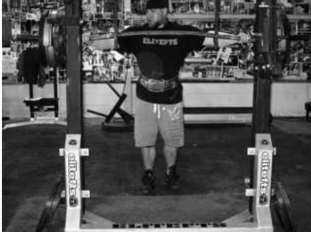
Figure 6: Squatting with Buffalo Bar