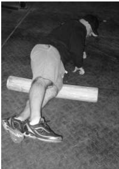
Figure 7: Use a PVC pipe if your IT band is really tight.

Perform 30-50 rolls per leg for the following areas of the body. I also recommend using a PVC pipe (this is very uncomfortable but effective). The PVC pipe should be a 6" diameter and 3 feet long. Wrap the PVC pipe in athletic tape so it doesn't slip.