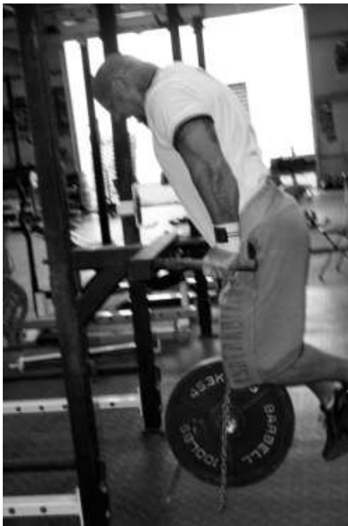
Figure 1: 200lbs Weighted Dips

The first four weeks will look something like this: