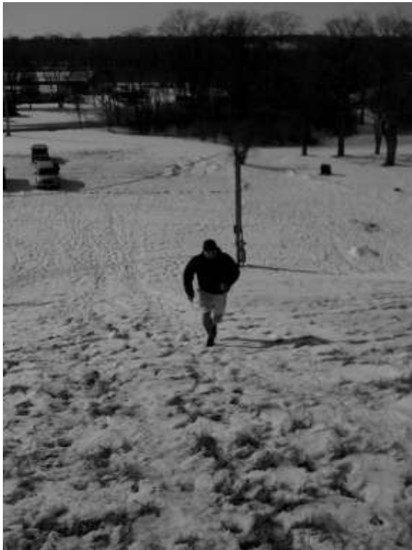
Figure 8: Running Hills in Springfield, Ohio

The two best things to do are Prowler pushes/sprints, or sprinting hills. This is not hard to do, and it's not hard to figure out. Just run. If you can, do better or more than you did the last time. Set a goal for yourself in terms of time or distance. I used the number of carries a true workhorse running back would want in a football game. The minimum here is 20. Minimum. Actually, that should be the first half. That's how I based my goal. If you don't have access to a hill or a Prowler, sprint with a weighted sled. If you don't have any of these, I don't know what to tell you.