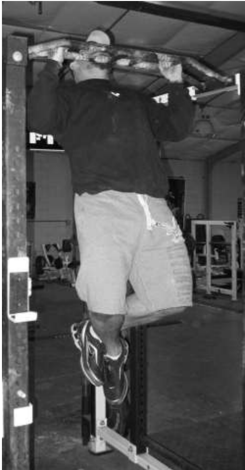
Figure 3: Vary your grip for every set.

Chin-ups, pull-ups, whatever. It doesn't matter to me. Just bring yourself up to a bar and back down again. Your grip should vary: wide, medium, close, overhand, underhand, neutral. Use ropes and towels for chins to build back and grip strength.