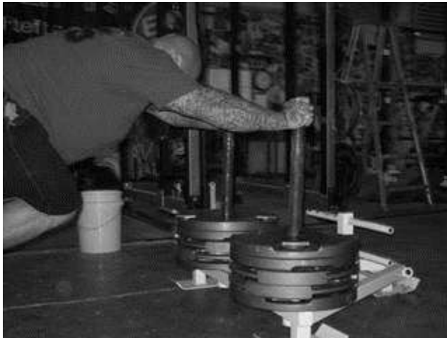
Figure 5: Prowler Work

That's it. Do this 3-4 times a week and you won't fall into the trap of being normal. You'll be strong, healthy and in shape. You won't make New Year's resolutions because you'll be living it every day. You can eat that final piece of pie and not count carbs because you just ran 20 hill sprints for the third time this week. You can wake up and not feel like shit because you've actually taken the time to foam roll and stretch. You actually have some traps from deadlifting. You don't fall for fitness trends, because you know what works. You stop caring what people say on the internet, because you're always making progress. You're always moving forward toward something.