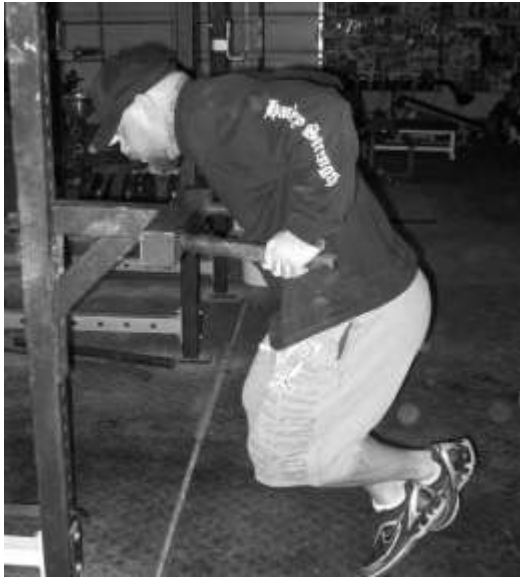
Figure 2: Bodyweight Dips

Dips are one of the most efficient ways to build your triceps, chest and shoulders. Many people can't do them due to shoulder problems, but I'm not one of them, and that makes me very happy. Since incorporating these into my own training, my entire upper body has gotten bigger and my triceps are much stronger, as well.