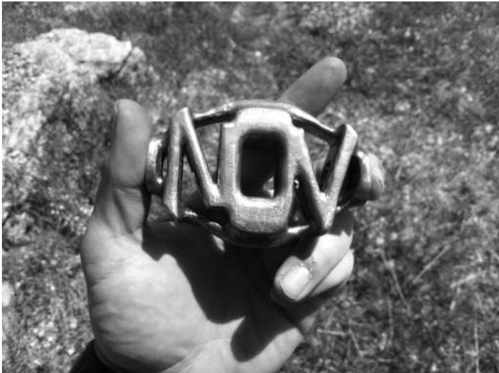
Figure 4: How to Start Your Chopper